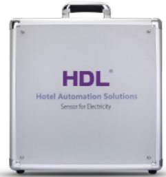
HDL Hospitality Demo Case without keycard