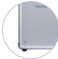
Strong Aircraft Grade Aluminum Body