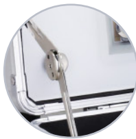
Automatic Locking Struts